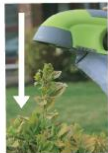
Vertical Trimming fig 1