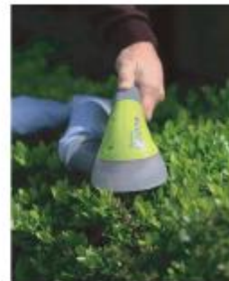
Horizontal trimming fig 2

The Garden Barber has been designed for lightweight trimming of shrubs, hedge area and topiary. For shaping unkempt straggly growth, we recommend adopting a vertical technique (see fig 1), bringing the machine down vertically onto the growth, until the desired length / depth is achieved, then continue to "blend" and shape accordingly.